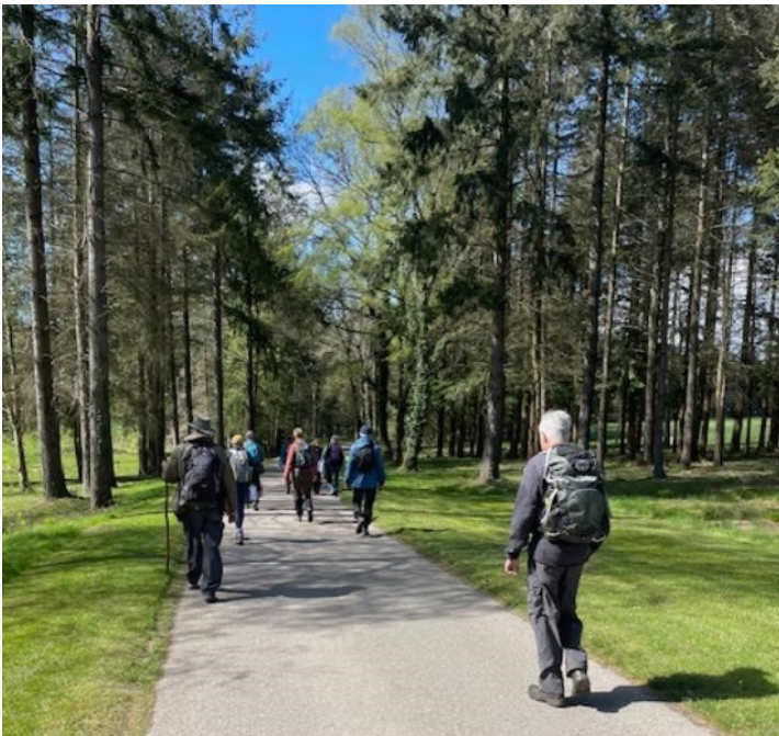
A montage of photos showing members enjoying a number of walks this Spring.